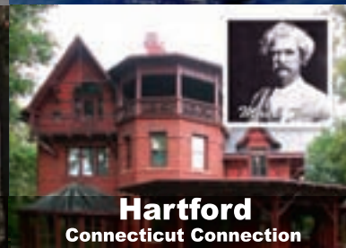
Hartford Connecticut Connection