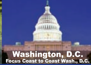
Washington, D.C. Focus Coast to Coast Wash., D.C.