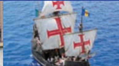
Columbus Columbus Research Connection