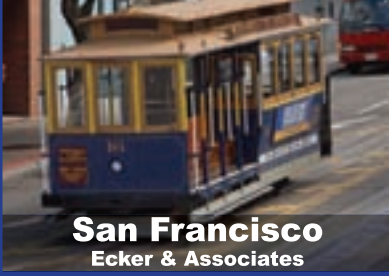
San Francisco Ecker & Associates