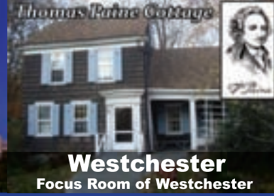
Westchester Focus Room of Westchester