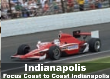
Indianapolis Focus Coast to Coast Indianapolis