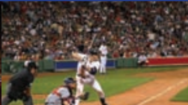
Boston Focus Coast to Coast Boston