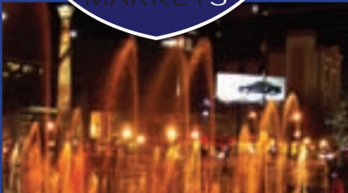
Atlanta Savitz Field & Focus