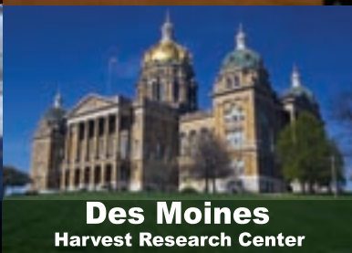
Des Moines Harvest Research Center