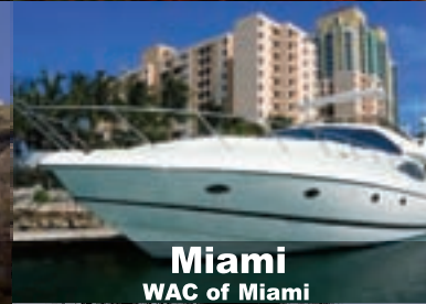
Miami WAC of Miami