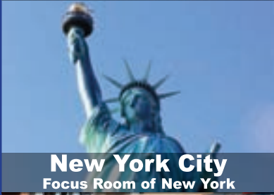
New York City Focus Room of New York