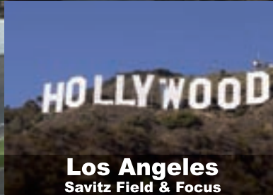
Los Angeles Savitz Field & Focus