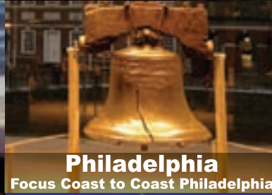
Philadelphia Focus Coast to Coast Philadelphia