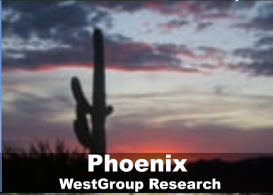
Phoenix WestGroup Research