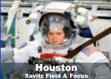
Houston Savitz Field & Focus