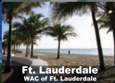
Ft. Lauderdale WAC of Ft. Lauderdale