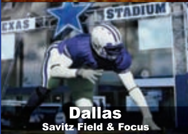
Dallas Savitz Field & Focus