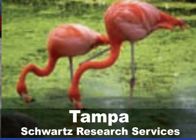
Tampa Schwartz Research Services