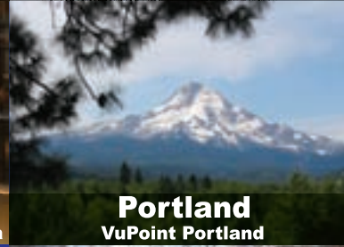
Portland VuPoint Portland